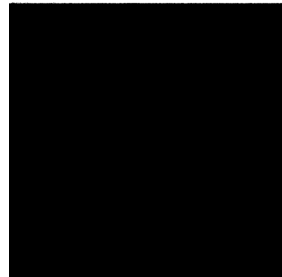
Right: The converted magneto as it arrives from Kirby.