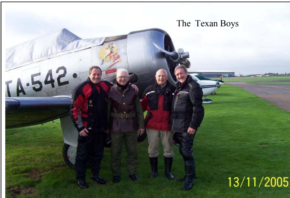
The Texan Boys